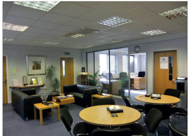
Reception Area and view into Office Suite