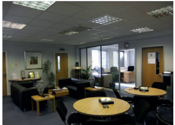
Reception Area and view into Office Suite